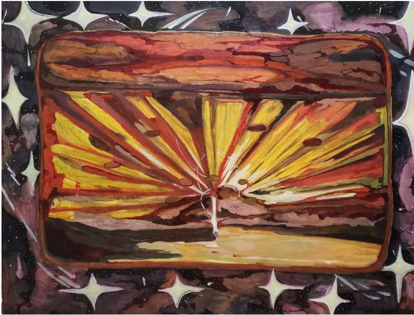
Landscape II (Starfall II)