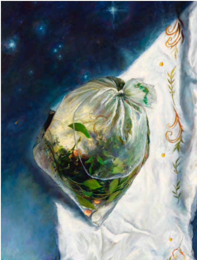
Medicine Bag - Chicago tap water, $1.73, and the alley plants that know me