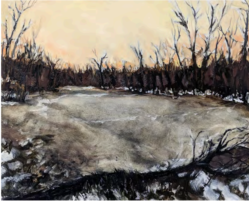
Sun Sets on Winter