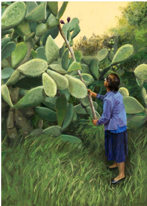
Mi Abue Ganchando Tunas