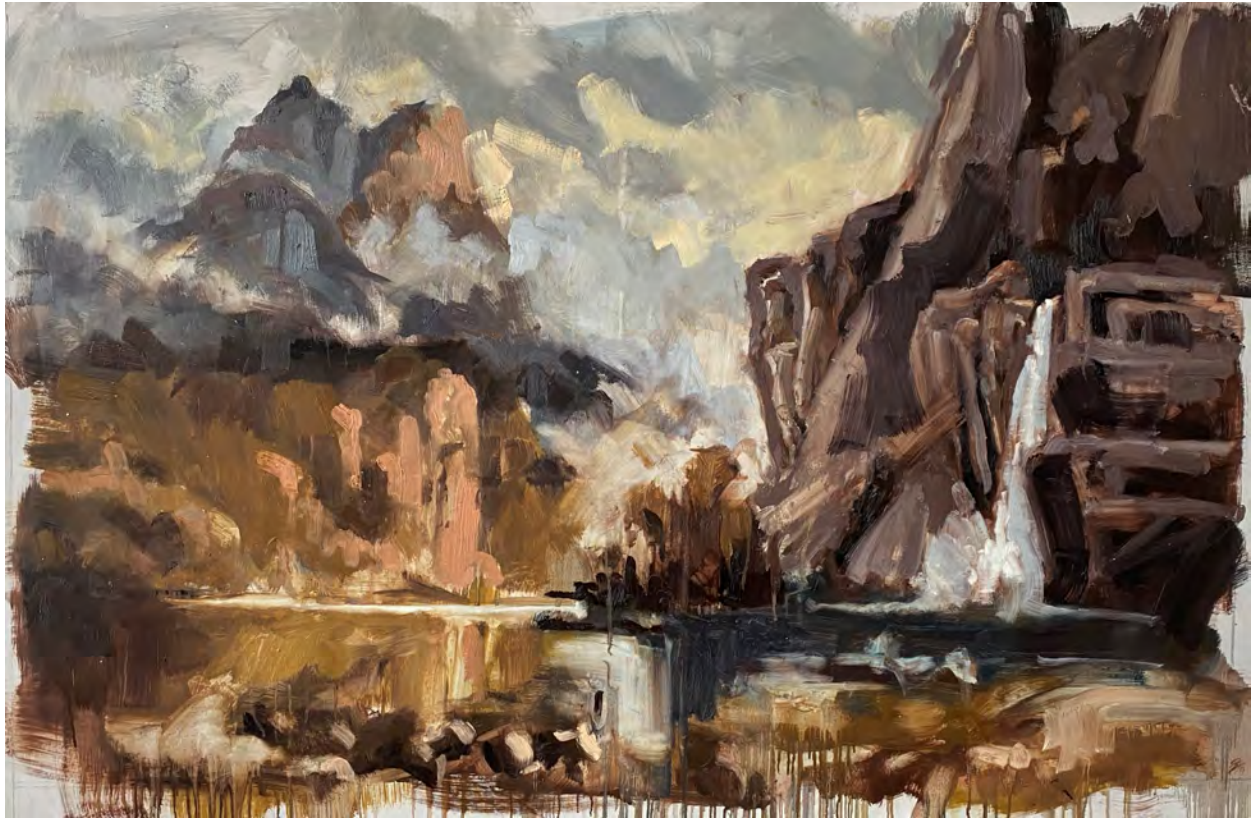
American Landscape with a Waterfall