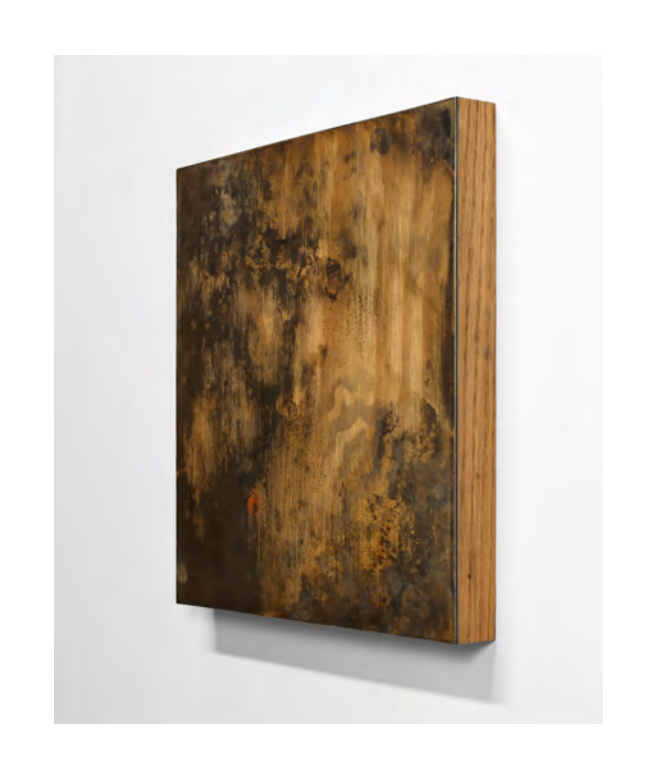
Ply 2 oil on aluminum 16" x 16" 2020